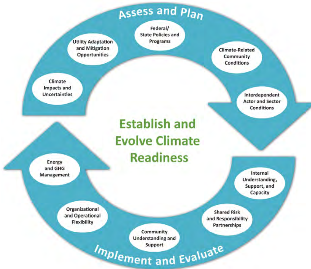
Figure 1: Climate Ready Adaptive Response Framework

Five activity areas are contained within each of the two stages. These areas of utility activity reflect the expectation that the water sector will see a continuum of engagement tailored to local conditions, needs, and capacity. The continuum moves from basic engagement – geared primarily to generate general climate change challenge awareness and implementation of effective utility management choices – to focused engagement – geared to produce explicit, climate-related planning, managerial, and operational adaptation and mitigation actions and investments.