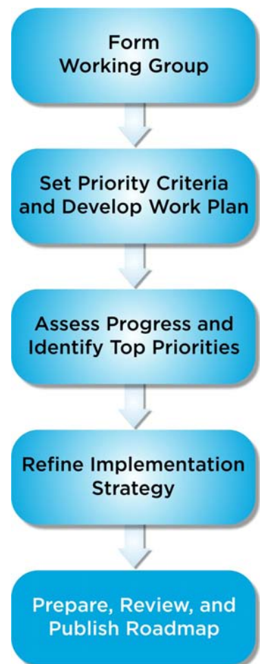
Figure A.1. Roadmap Update Process

On March 20, 2013, the Working Group held a CIPAC Strategic Priorities Planning Meeting in Washington, D.C. During the meeting, 23 representatives from the Water Sector, including Working Group members, owners and operators, state representatives, associations, and subject matter experts, reviewed the accomplishments made since 2009; examined remaining opportunities; identified the scenarios that create the highest risk to the Water Sector and established the top priorities to improve the security and resilience of critical infrastructures over the next five years.