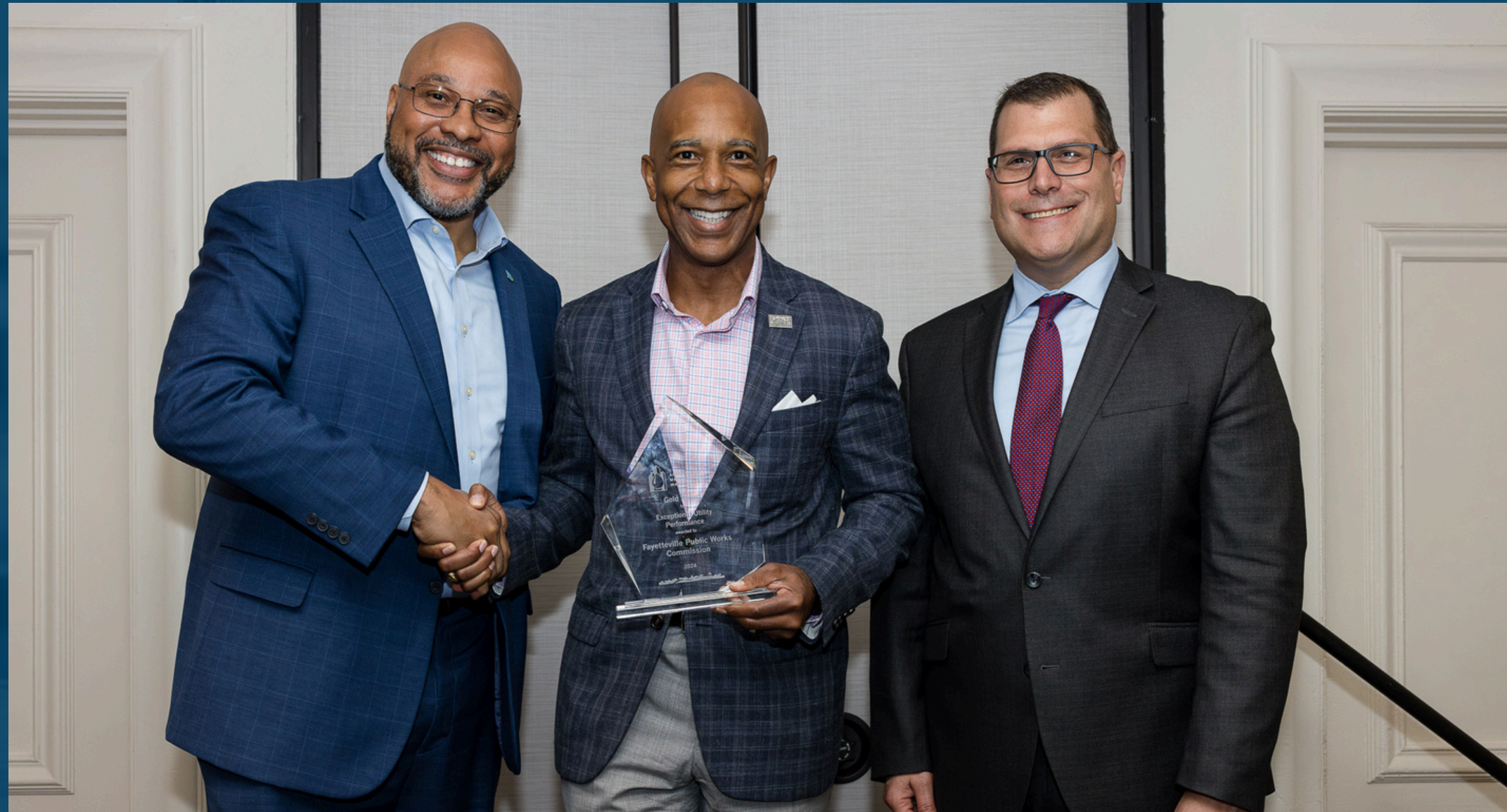
FAYETTEVILLE PUBLIC WORKS COMMISSION (2024)