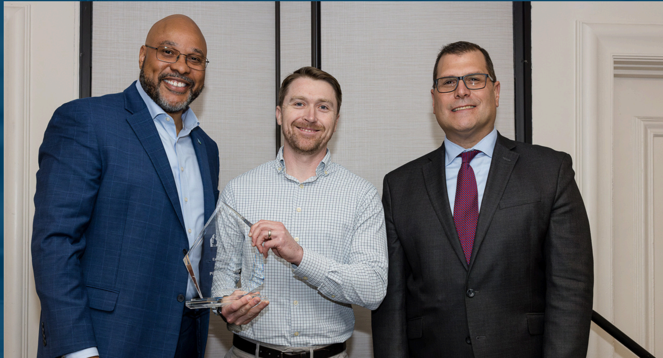
PITTSBURGH WATER (2024)